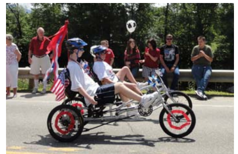
Old Home Day Parade 2011