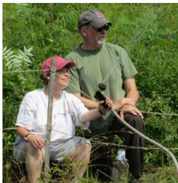
Adaptive Gardening at Sunset Hill House