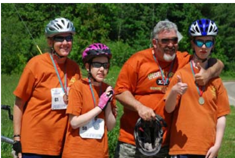
2011 Summer Special Olympics State Games