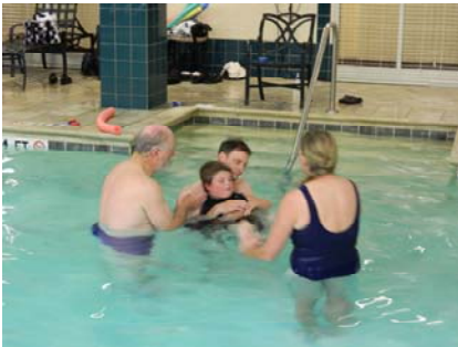
Summer Swim Program